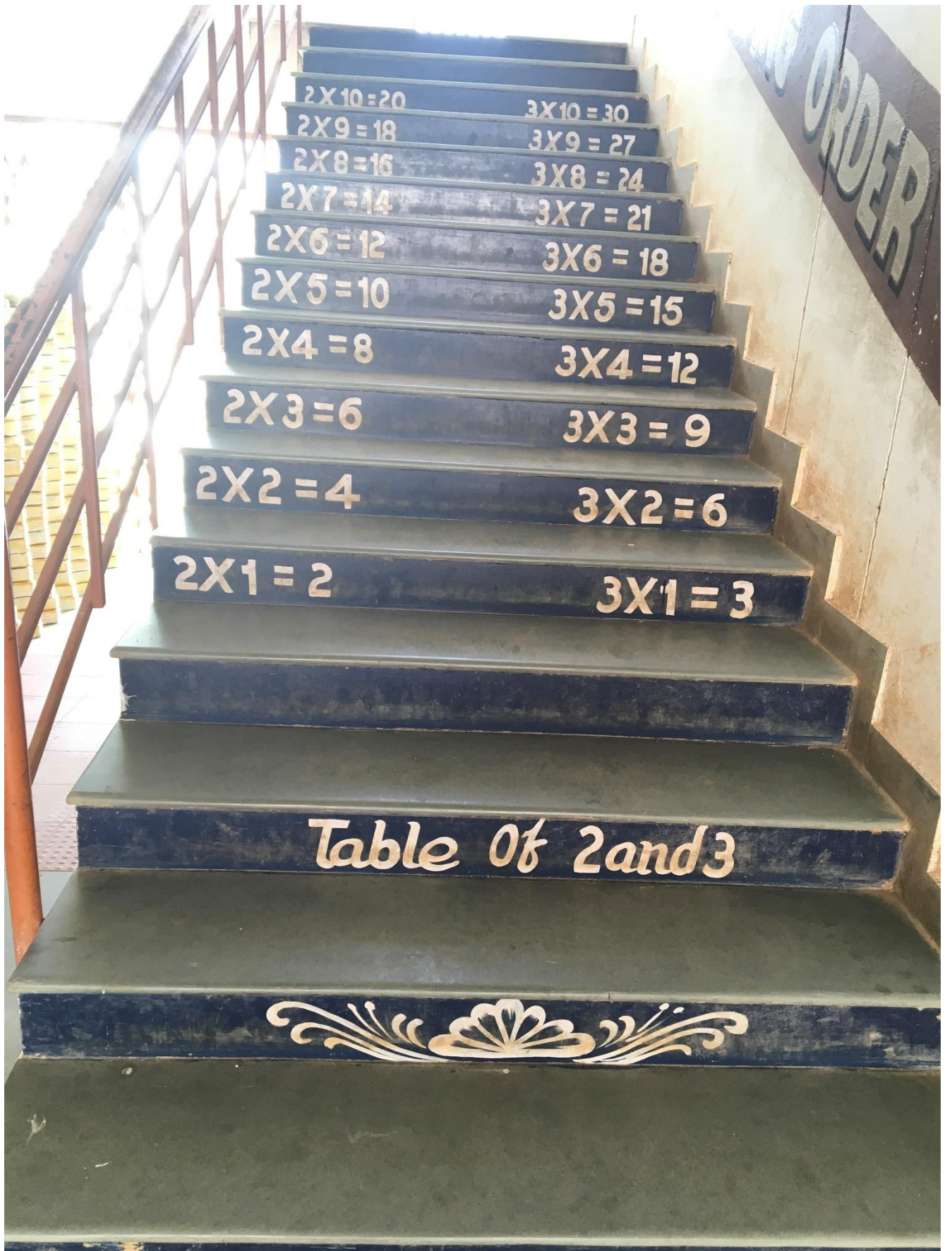
Table of 2 and 3